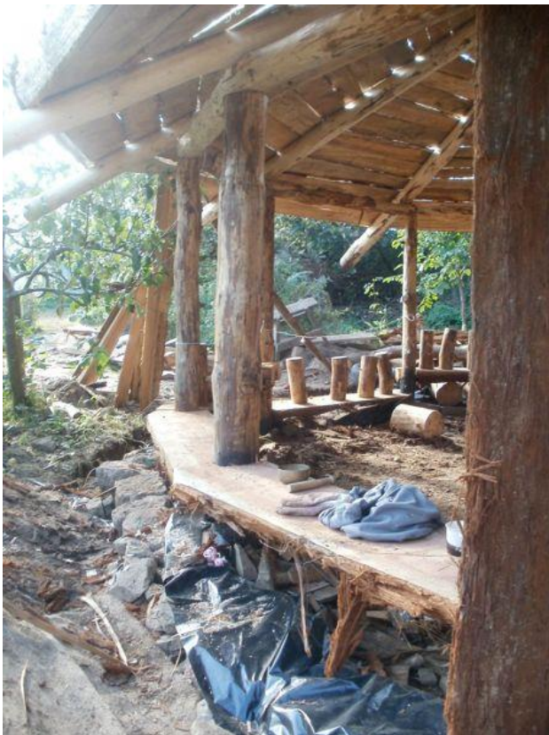
(example of construction type, unfinished)

This robust round pavilion structure would act as a shelter/play space during playtime, evenings and weekends, and an outdoor classroom as and when required. Construction would be offsite (3-4 weeks) with 3-4 weeks onsite to complete, and it could be expected to last 20-25 years with minimal maintenance.