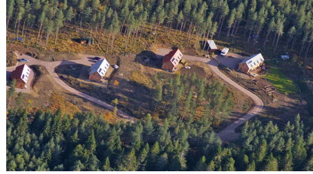
Ardgeal Phase 1—Houses in the Forrest

Following the success of first phase of 4 sustainable affordable homes, the Trust is working with its key partners to deliver Phase 2 and hope to bring 6 new affordable homes for sale over the next two years.