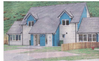
Houses at Achtercairn, Gairloch

The Trust is the lead developer for this key village redevelopment site at Achtercairn. Already, Albyn HS have completed Phase 1 and have built 12 new homes, 8 for rent and 4 for sale under the low cost home ownership scheme (LIFT - Low Cost Initiative for First Time Buyers).