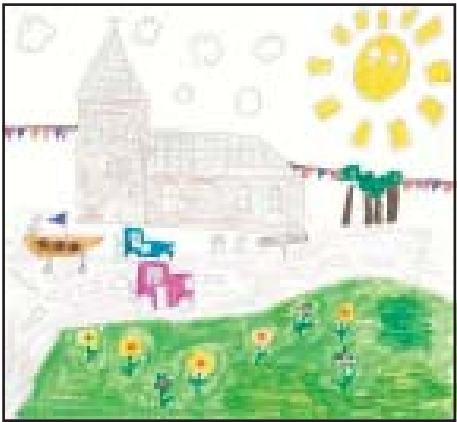
By Zoe MacBeath Age 7