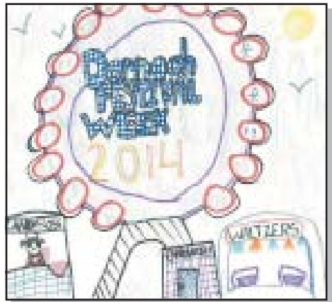
By Skye Warner Age 12