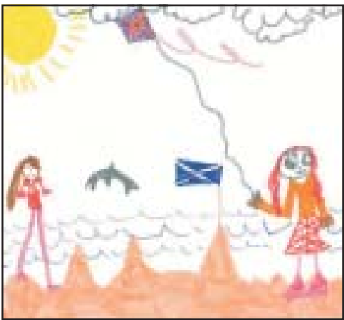
By Neve McAffer Age 5