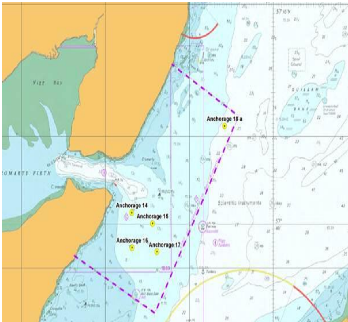
Chart indicating proposed Ship to Ship transfer mooring positions.