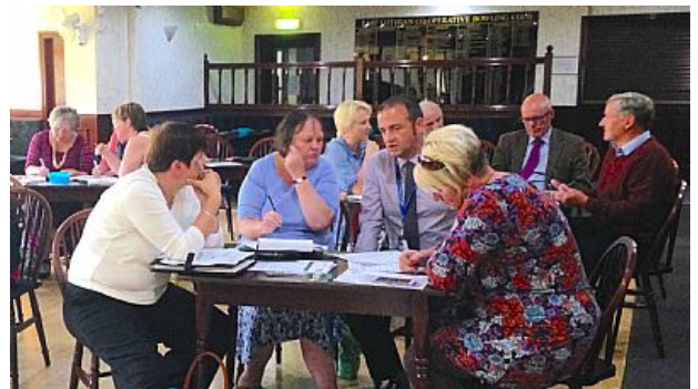
Tranent meeting on 15 August 2016