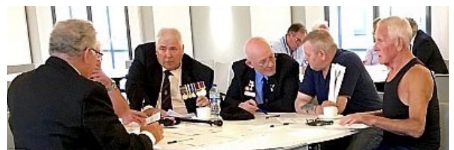
Saltcoats meeting on 4 August 2016