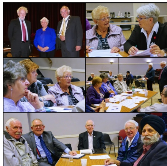
Scenes at the Glasgow meeting

We do not yet know what new powers will be devolved to the Scottish Parliament, but we will ensure that your voices will be heard in any new structure that emerges. To that end we were delighted that Shona Robison the Cabinet Secretary for Commonwealth Games, Sport, Equalities and Pensioners' Rights attended our August Committee meeting. We discussed proposed pensions reforms and I cited examples of higher pensions in other countries. Ms Robison commented on these and also responded to questions about health inequality, life expectancy and isolation. She thanked SOPA for our involvement in promoting older people's interests and we welcomed her intention to keep in contact with us.