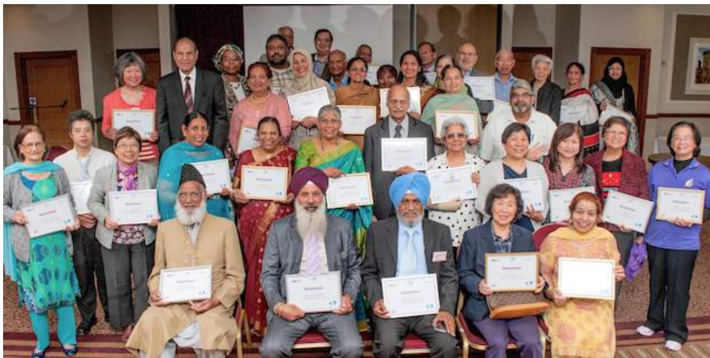
Photo - Volunteers with their certificates in recognition of their contribution to society at a multi-cultural event held during June's Volunteers' Week